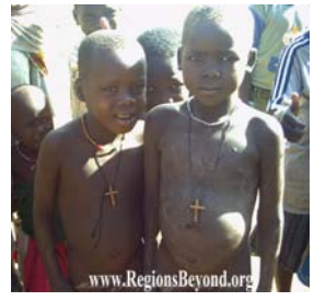
Medical Clinic in Sudan

Yirgacheffe: Deep in the coffee growing region of Ethiopia, we held a pastor's conference and "Big Meeting." After winding up a mountain the vehicle veered off the road onto what seemed to be nothing more than a foot path. We were wondering where we were going and if there could possibly be any people at such an odd location. To our surprise a road suddenly appeared. An even greater surprise was waiting for us about two kilometers later as a large field filled with tens of thousands of people emerged.