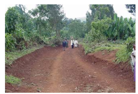
Church Members Dug A Road Through Rugged Terrain.

Road Is Constructed By Hand: The location of the crusade was so remote that it was inaccessible by vehicle. In their desire to have us come, the local church built a road by hand. For several days approximately 120 men and women constructed a road through the rugged terrain on what was previously nothing more than a foot path. The sight was indescribable as we entered into the crusade grounds. Waiting for us were thousands of people who began to shout with joy as our vehicle approached.