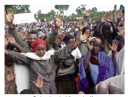
Salvation in Yirgacheffe

Yirgacheffe: Deep in the coffee growing region of Ethiopia, we held a pastor's conference and "Big Meeting." After winding up a mountain the vehicle veered off the road onto what seemed to be nothing more than a foot path. We were wondering where we were going and if there could possibly be any people at such an odd location. To our surprise a road suddenly appeared. An even greater surprise was waiting for us about two kilometers later as a large field filled with tens of thousands of people emerged.